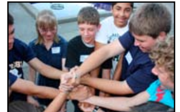
A group of incoming freshmen untangle their arms in an ice-breaker game during the Rootbeer Social in August.