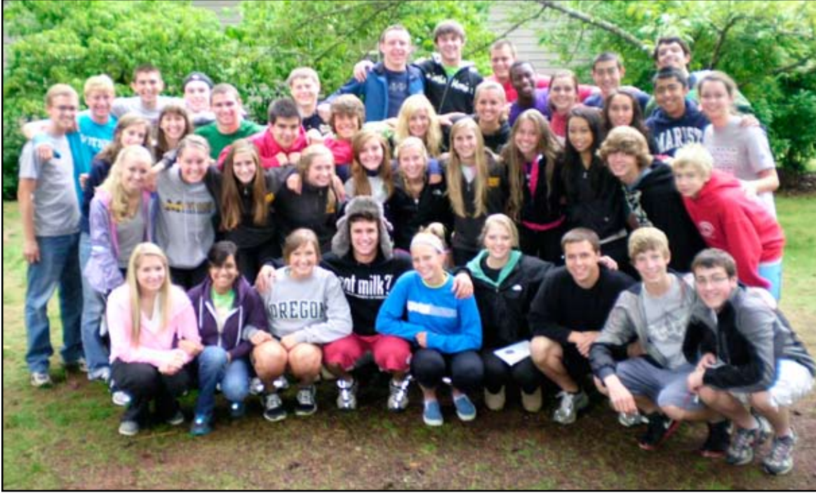
Marist's new retreat team poses together at their Formation Retreat this past weekend.