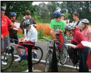
The Astronomy Class stops to observe along the solar system bike ride.