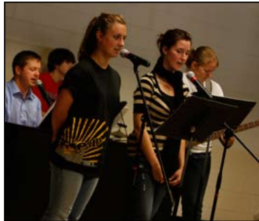
Senior Proclaim members provide music during the Senior Class Mass.