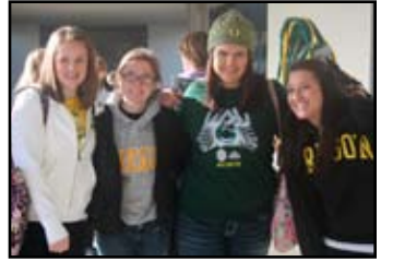
Several sophomore girls celebrate their beloved Ducks.