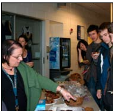
Students buy food items baked by staff members at the bake sale benefitting Project Starfish Tuesday.