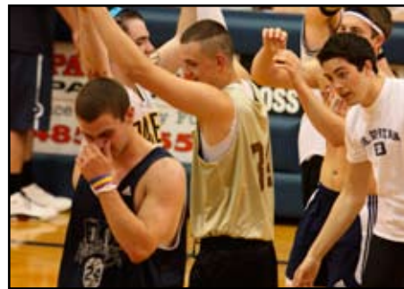
The Mr. Spartans celebrate after defeating the staff by one in the annual basketball game.