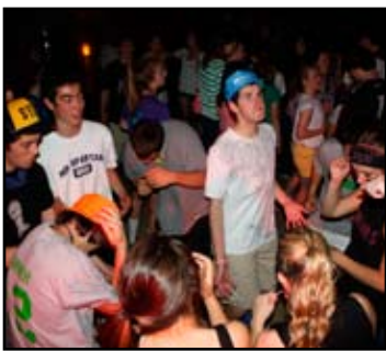
Seniors dance at Homegoing.