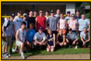
The Seniors celebrate their win after the students vs. staff softball game.