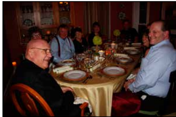
The group that bought the staff auction package prepare for their meal Saturday night.