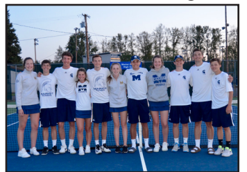
Seniors of the boys and girls tennis teams.